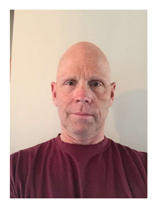
Governor Greg Kuhn