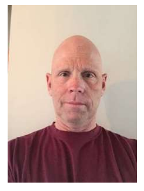
Governor Greg Kuhn