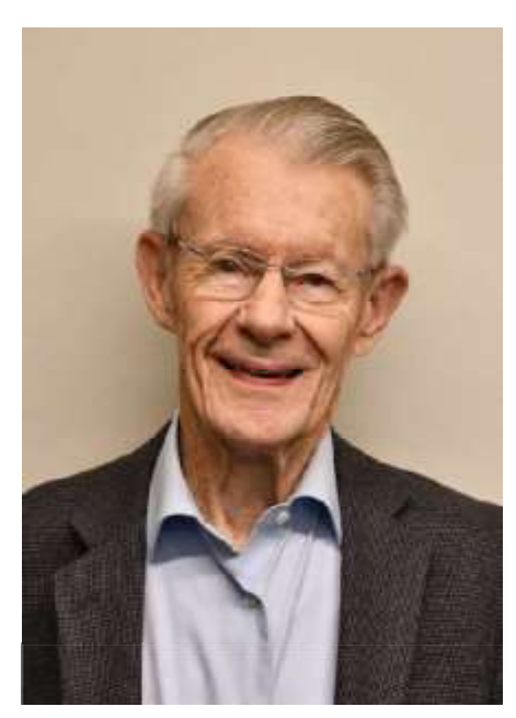
Governor Elect Walt Wilms