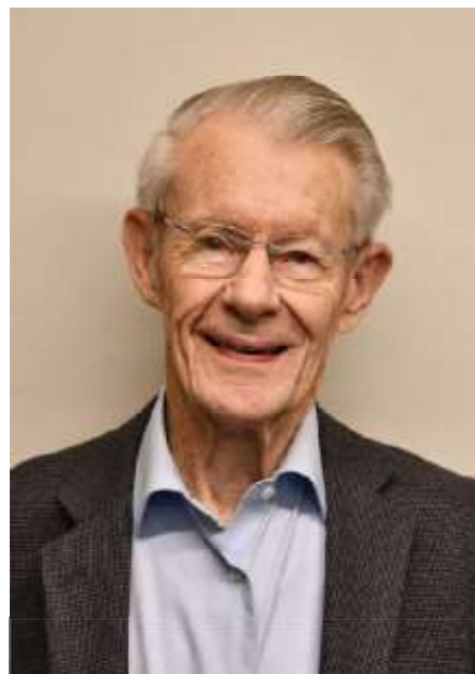
Governor Walt Wilms